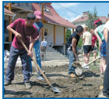
Some of our youth "digging in" in Székelykeresztúr.

The 7th graders will be creating social statements using art as a medium for expression. Some of these creations will be