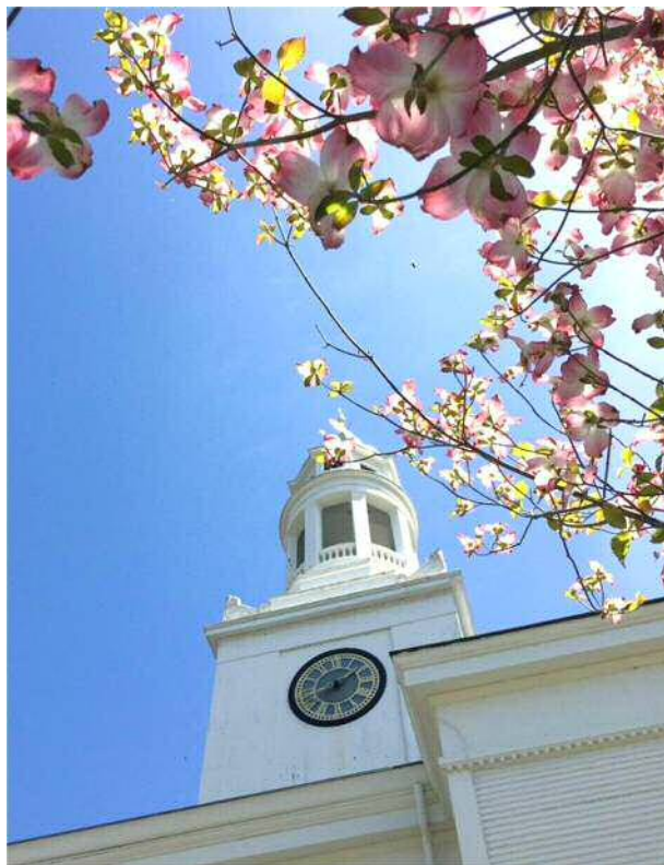
Church steeple framed by the Valerie Holt memorial dogwood.