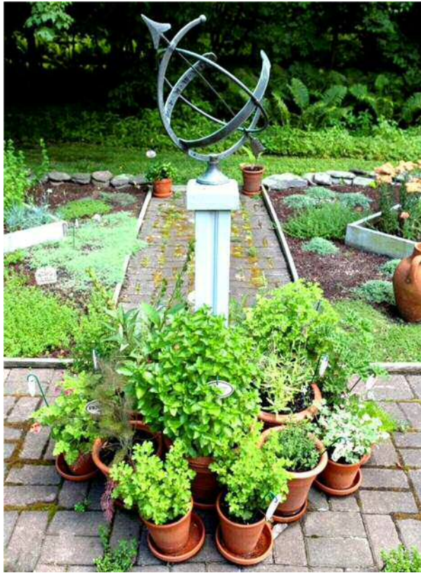
Herb garden including the armillary sundial .